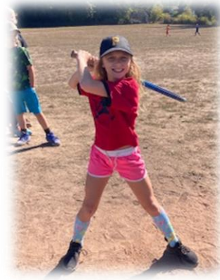
Baaaaaa – ter up had a whole new meaning at Cedar Elemenary on Thursday!