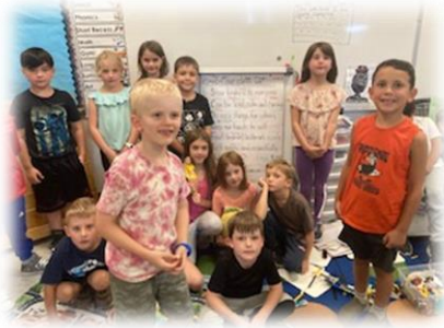
Div. 5 Kindness Contract