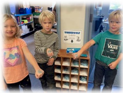
We got a PACK ticket!