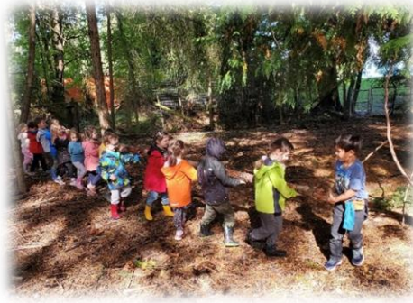
Div. 1 Wolf Pack working together!