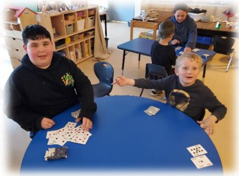
Big Buddies teaching Little Buddies game of War