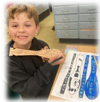
Div. 10 Paddle Project