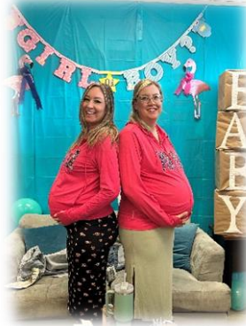
Congrats! We will miss you!