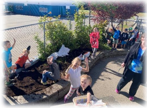
Garden Bed Makeover by Div. 4