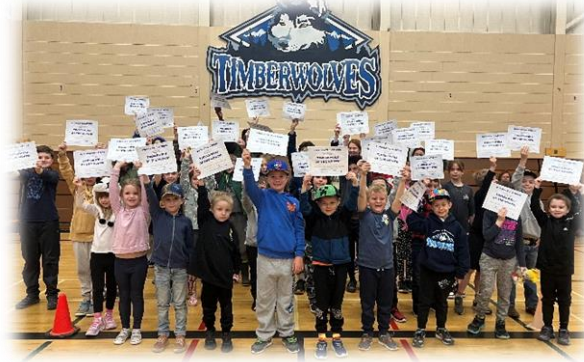
Congratulations, Timberwolves of the Month!